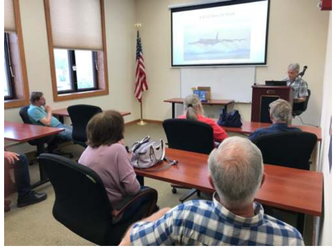
Aviation History Program

Less than a month till school is out; and the moment we all have been waiting for... Summer Break! When summer break begins so does Summer Reading Program. Our staff has been working hard preparing for the kickoff event on June 2 nd . With the weather improving so has the attendance in the library and with programs. Coldwater had a total of 4,398 people visited the library in April; which is a 39% increase from the previous year. The in-person computer questions/internet use was 278 for April and that is a 47% increase from last year. One of our most popular clubs is Anime night. Teens get together and share a cultural inspired snack; this month was Ramen noodles, and watch Anime. The Anime club meets on the last Wednesday of the month and in April had 16 in attendance.